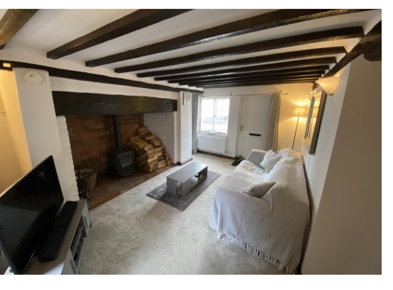
Asking Price £242,500

12 Cock Street Wymondham Norfolk Nr18 0bx