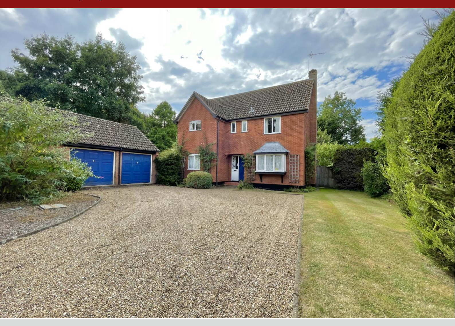
March House 12 Victoria Close Diss IP22 4JH