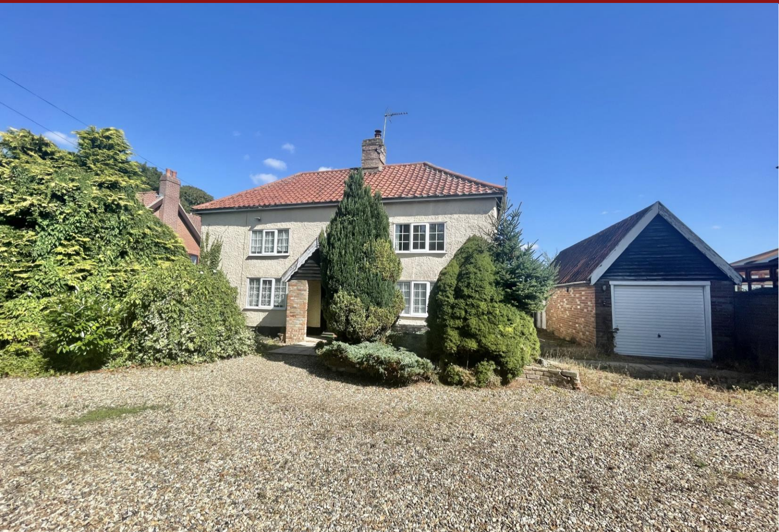
The Glebe House Attleborough Road Little Ellingham NR17 1JH