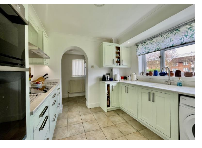
Asking Price of £395,000

Birchwood House Redlingfield Road Occold IP23 7PG