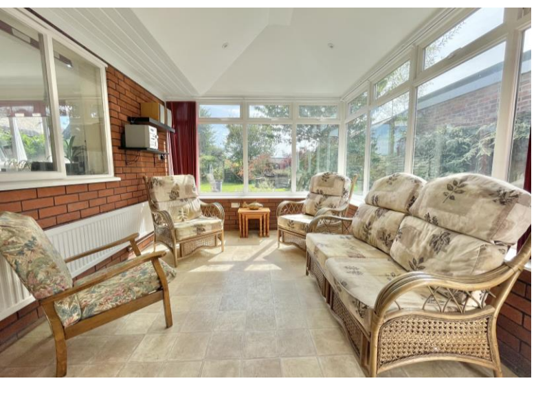
Asking price: £375,000