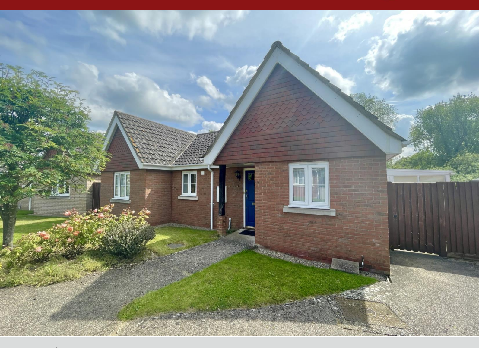
7 Daniel Gardens Eye Suffolk IP23 7BQ