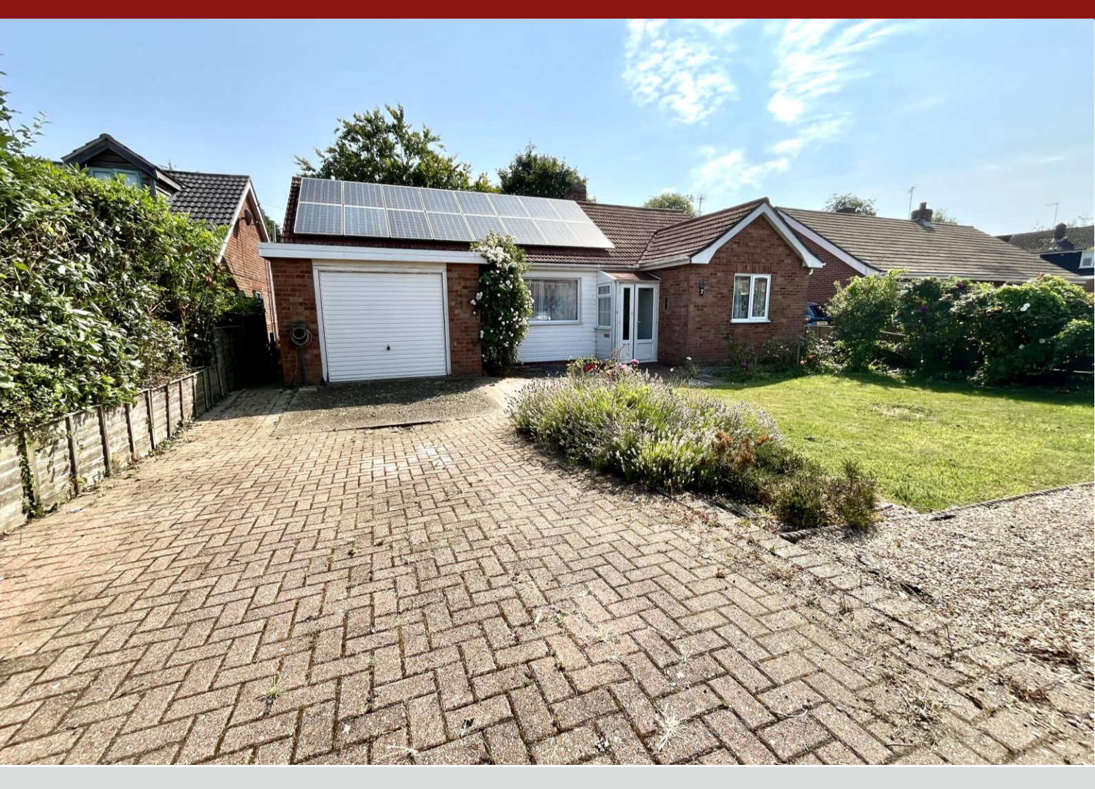
2 Baxter Close Hingham NR9 4HZ