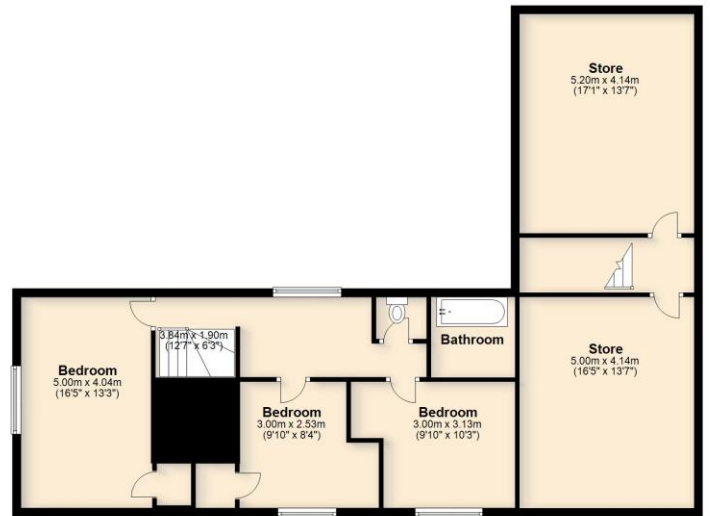
First Floor Approx. 109.8 sq. metres (1182.2 sq. feet)