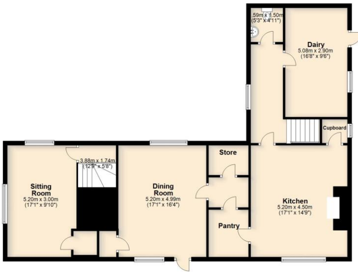
Ground Floor Approx. 114.4 sq. metres (1231.7 sq. feet)