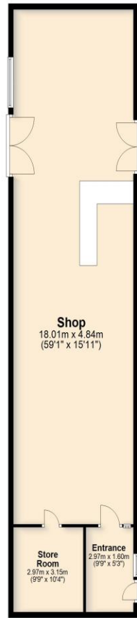
Ground Floor Approx. 222.6 sq. metres (2396.1 sq. feet)

Total area: approx. 222.6 sq. metres (2396.1 sq. feet)